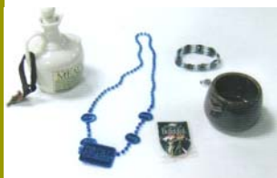
Items that tested positive for lead in May 2006 included: Bunratty Meade ceramic bottle, casino "Mardi Gras" beads, magnetic bracelet, decorative pin, and glazed kitchen pottery. These items are not under any recall. Many Claire's jewelry items also tested high for lead.

PARENTS: Bring items that you want tested to the Trenton YMCA on Tuesday, December 12 from 10:00 AM—1:00 PM. Testing by Niton, refreshments by Isles. This equipment is sensitive enough to test most holiday gifts through original packaging. Call 609-341-4717 for more details.