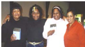
Parents at Trinity Cathedral Preschool Academy receive Wipe Out Lead New Jersey dust kits at a lead presentation during Childhood Lead Poisoning Prevention week in Trenton.

Since 2005, Trenton/Mercer County has been increasing lead dust testing, thanks to the Wipe Out Lead New Jersey program. Statistics through November 9, 2006 indicate that 301 kits were distributed in Trenton, and 169 kits returned to the laboratory.