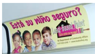
NJ Dept of Community Affairs signs on NJ Transit trains & buses remind observers about lead-based paint in homes in English & Spanish.

To qualify for these programs, you must live in a house built before 1971 that contains lead-based paint, have property insurance, and be current on your water, sewer and property taxes.