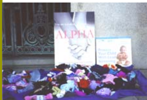
The four lead coalitions in New Jersey collected gloves to symbolize how many NJ children had elevated lead levels in 2005.

Lead is the number one preventable disease affecting America's children, and lead poisoning is entirely preventable.